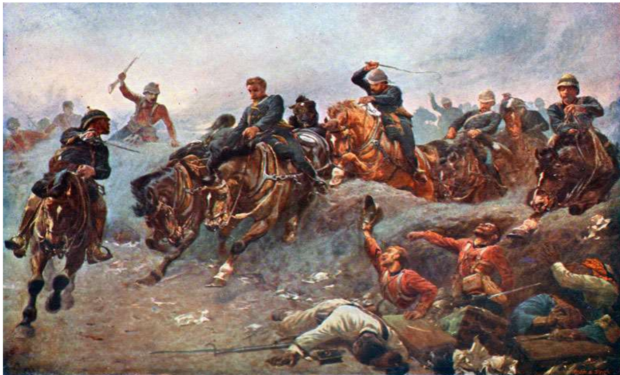
Figure 5. Horse Artillery going into action (this painting is of the Battle of Tel-el-Kebir near Alexandria in Egypt in 1882).

Bays) with the local rank of Major (Bimbashi) who was active commanding a Squadron in all actions from Dongola in 1896 to the capture of Khartoum in 1898. The occupation of Dongola on 23 September 1896, followed by harrying of the Mahdist troops by the Camel Corps and cavalry, ended that year's Campaign (Anon, 1896; Churchill, 1973). The successful operations caused great satisfaction in England and a generous gazette of honours was published. Progress south continued sporadically until the Egyptians arrived at Atbara at the confluence of the Atbara and Nile Rivers.