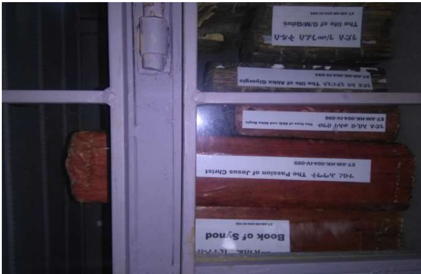
Figure 1. Some parchment manuscript books within the museum show case which one put over the other.

The other stunning heritage in the museum is pulpits. These pulpits are made from one pieces of wood and it can be folded and opened. They are used or served for the purpose of reading of holy books which are very cumbersome for handling (informants Aba kidane Maryam and Aba Kinfe Michael, interviewed on September 2016).