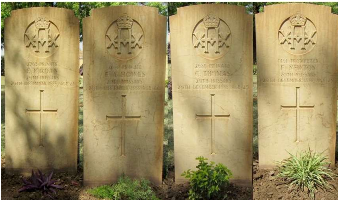
Figure 3. Headstones of four 20th Hussars cavalry men killed at El Gemaizah in 1888 whose remains were re-interred in the Khartoum cemetery of the Commonwealth War Graves Commission (the stones in place are more widely spaced but have been combined here for convenient viewing)

donkeys and camels plus large supplies of grain which proved to be of great use to the British and Indians (Churchill, 1973; Anon, 2016a).