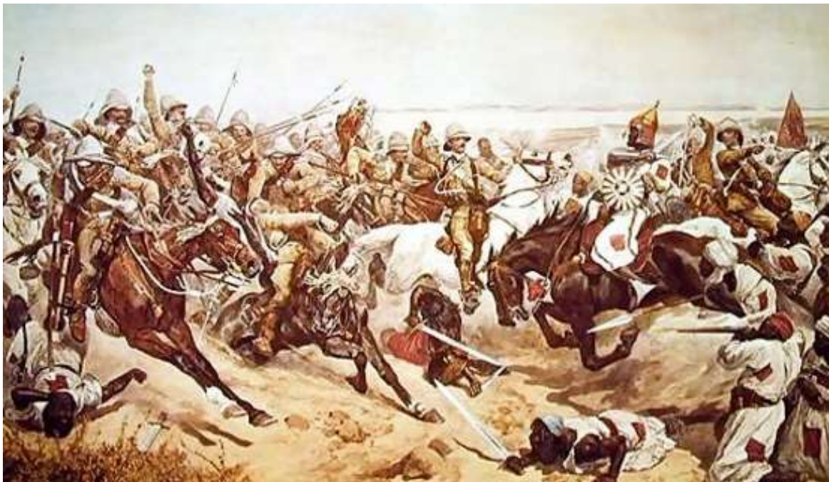
Figure 6. The charge of the 21st Lancers at Omdurman (painting by Richard Caton Woodville).

in Cairo on the way south and were understaffed, so many officers were seconded from other cavalry units. These included Winston Churchill from the 4th Hussars, who was also the War Correspondent for the Morning Post newspaper. The artillery was managed as a separate force and comprised the 1st Egyptian Horse Battery with six 6-cm Krupps guns and two Maxims, the 32nd Field Battery Royal Artillery with eight guns, the 37th Field Battery Royal Artillery with six 6-cm Krupp guns, a Royal Artillery unit of two 40-pound guns and the 2nd, 3rd, 4th and 5th Egyptian Field Batteries each with six Maxim-Nordenfeldt guns and two Maxims (Zeigler, 1973; Featherstone, 1993). On the Sudanese side, a minimum of 5494 horses were at Omdurman distributed unevenly among the “Flags” (= Divisions) of the Khalifa’s army, most coming from the Baggara tribes of western Sudan (Churchill, 1973; Anglesey, 1982; Pollock, 1999; Badsey, 2008).