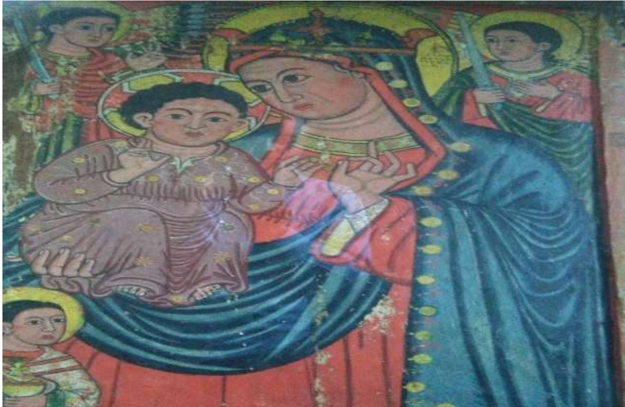
Figure 4. Icon of St Mary hanged on the wall of the museum.

priceless and astonishing treasures could not be accessible for domestic and international tourists due to various hindering factors and some of these are discussed as follows. priceless and astonishing treasures could not be accessible for domestic and international tourists due to various hindering factors and some of these are discussed as follows.