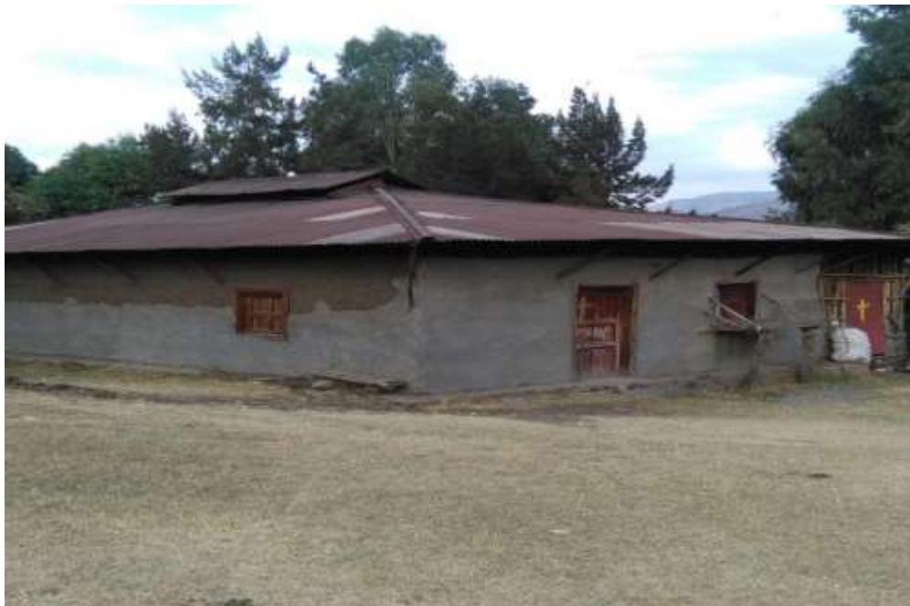
Figure 5. The Tegbar bate (Refectory).

does not have its own website that can help to promote its resources; however, they did not promote the tourism resources either through printing or electronics media due to lack of finance and trained man power. Even there is no single billboard on the way to the monastery or in the nearby town of Haiq to indicate the direction where the monastery is located. Due to this and other related hindrances, all the innumerable and priceless heritage of the monastery became inaccessible for domestic and international tourists.