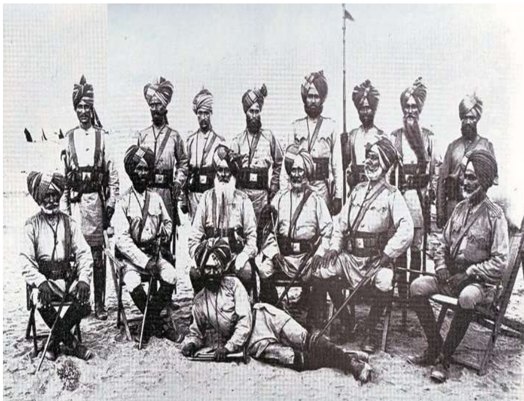
Figure 2. Indian Officers of the 9th Bengal Cavalry with the Suakin Field Force 1885

came from England and generally succumbed to the rigours of the Sudanese climate. Egyptian cavalry mounts already at Suakin replaced them: the Mounted Infantry had Arab horses better adapted to local conditions. In addition to the climate, hunger and thirst, the horses suffered from cutaneous habronemiasis, a severe hypersensitive skin problem that was difficult to treat at that time. This was caused by heavy infestations of the larvae of the nematode genera Habronema and Draschia .