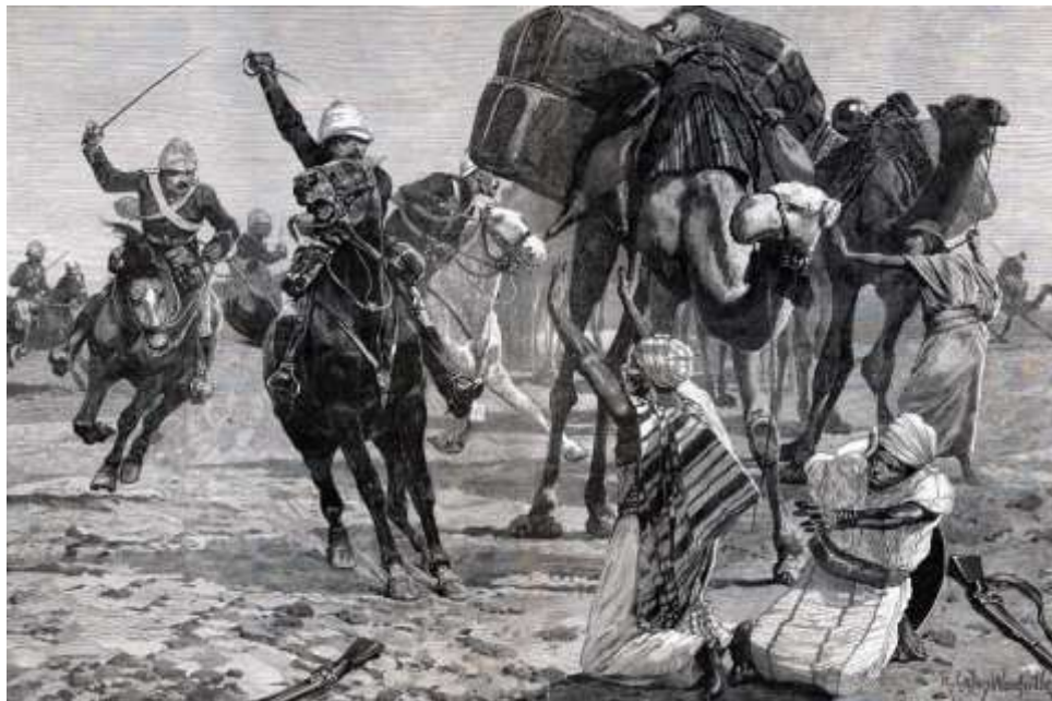
Figure 4. 19th Hussars capturing enemy supplies at the Battle of Abu Klea (illustration by Richard Caton Woodville for the Illustrated London News)

borders, the Khalifa (the Mahdi's successor) determined to end the "Abyssinian Problem". An avast army won several small fights in Ethiopia and sacked its capital at Gondar. In revenge, the Ethiopians attacked Gallabat on 10 March 1889 with an army of 130 000 foot and 20 000 cavalry. After initial success they were driven off and, after up to 15 000 deaths on each side, the body of the Ethiopian king, minus its head, was displayed in Omdurman as a trophy (Wingate, 1964; Churchill, 1973; Erlich, 1996; Bahru, 2001). Having succeeded against Ethiopia, the Khalifa determined to impose his religion on Egypt. The Battle of Toski, about 75 km inside Egypt near Abu Simbel fought on 3 August 1889, which is the result. The Mahdists were soundly beaten by the Egyptians under British officers, including Major Horatio Herbert Kitchener (later Field Marshal Earl Kitchener of Khartoum), who led their cavalry. The only British military unit involved was a Squadron of 20th Hussars who lost one man killed with four others injured. In addition, British officers commanding the Egyptian and Sudanese infantry had their own horses. Egyptian cavalry and Horse Artillery were instrumental in the victory but there were apparently no horses on the Mahdist side (The Spectator, 1889).