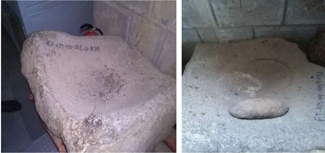
Figure 3. Sacrificing stone and millstone.

conducted during the reign of Emperor Haile Sillase (Aba Birhane Hewt interviewed on November 2016). The house had been used as a kitchen; Abune Iyesus Moa, the founding father and Abune Teklhaymant one of his famous fellow cooked grain and prepared food for other monks in this historic house. The house was built of wood, mud and stone while its roof was covered by grass. It has five wooden windows and two wooden doors. The interior part has two sections and in one of the interior section there are two erected timbers which have been used as pillar of the house and now testify about the oldness of the house (informant, Aba Gebre Medhin, interview on November 2016). Currently, some part of the exterior wall is covered by cement. The roof is also changed and covered by corrugated iron sheet; meanwhile its function is still unchanged. In the monastery there is division of labor, but all monks consumed the same types of food without considering status and age. Those monks who take the responsibility of food preparation cook the meal for the entire monks in this historic house and every monk except the aged take the allotted food there.