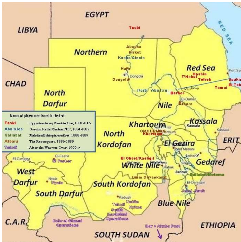
Figure 1. Map of Sudan showing places mentioned in the text (the names of the Autonomous States (e.g North Kordofan) are those existing in 2014).

during the nineteenth and twentieth centuries by providing a summary of the published documents.